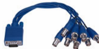
9-16 Cams Video Cable