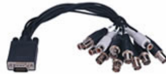
1-8 Cams Video/Audio Cable