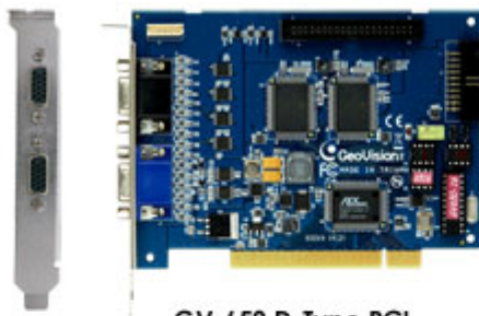
GV-650 D-Type PCI