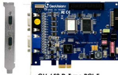
GV-650 D-Type PCI-E