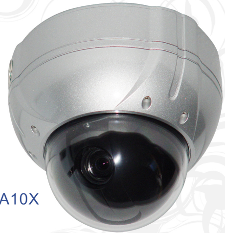
Product Code: PTZ-A10X