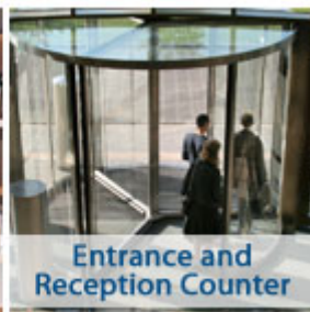
Entrance and Reception Counter