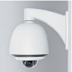
Gooseneck Wall Mount