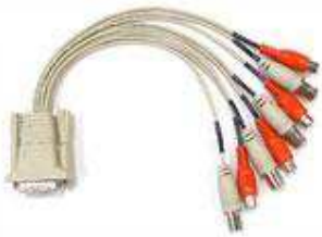
8 cam video cable