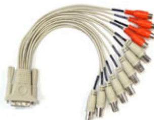
8 cam video cable