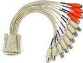
8 cam video cable