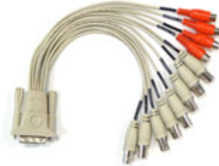
8 cam video cable