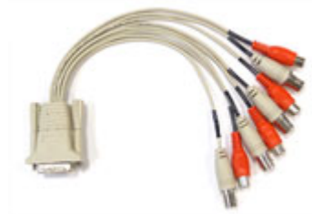
4 cam video cable