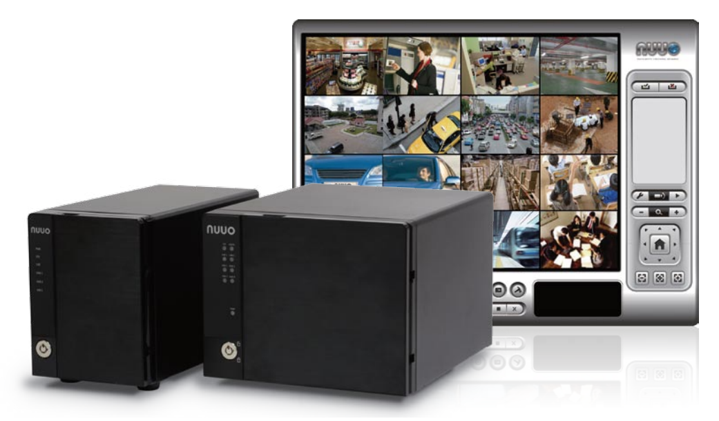
Manage 2 / 4 / 8 / 16 IP Camera