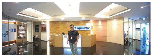
180° Panoramic View