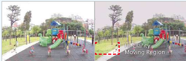
Without Smart Stream II