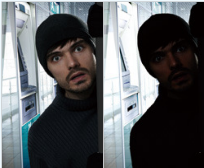
With WDR Pro