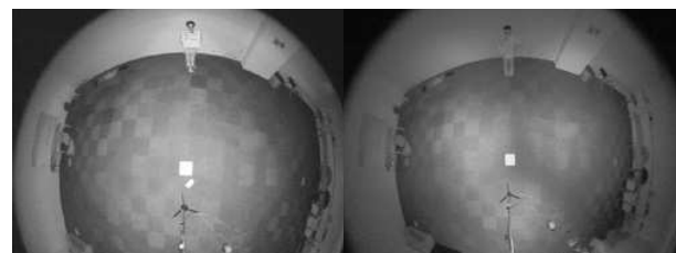
IR with High Uniformity

Combining both H.265 and VIVOTEK Smart Stream II, the camera can reduce bandwidth and storage consumption up to 80% more than cameras using H.264.