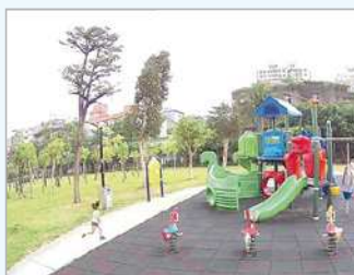
Without Smart Stream II

Save up to 50% of bandwidth and storage by optimizing quality for moving regions or ROI.