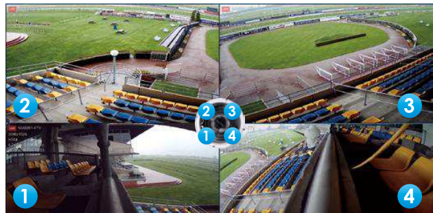
Multiple sensors, Adjustable views