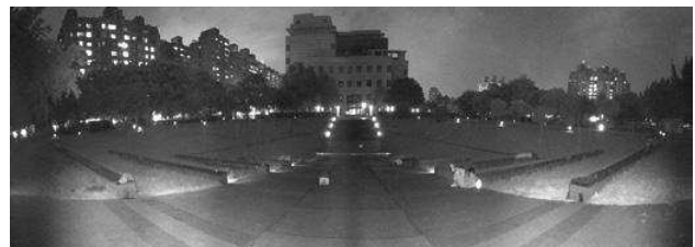
Panoramic IR Illumination