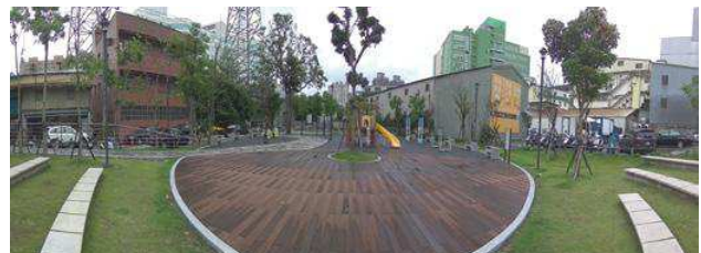
8MP Panoramic View