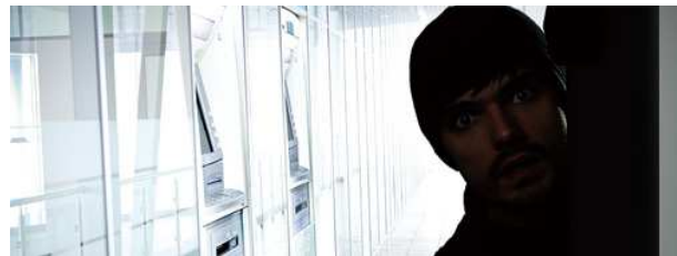
Without WDR Pro