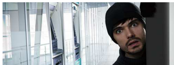
With WDR Pro